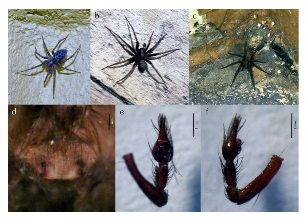
Fig. 1. Tegenaria domestica. a. Specimen from El Calafate, habitus; b. Specimen from Ushuaia, habitus; c. Female from Punta Arenas, outside its funnel; d. Female epigynum; e. Male pedipalp, ventral view; f. Male pedipalp, lateral view.