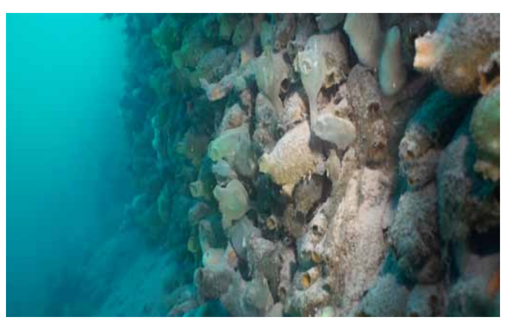
Fig. 4. Dense ascidian populations at the Fourcade Glacier (Potter Cove, South Shetland Islands)

clear to what extent penguins and seals can easily switch to other food such as fish and squid; only in the case of Weddell seals fish are staple food locally (Plötz et al. 2001).