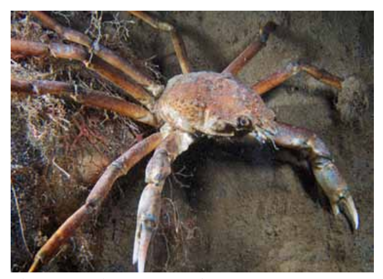
Fig. 5. Hyas araneus - an alien species invading Antarctic waters?

may facilitate or impede exchange. In the long term, the question arises whether the PF will persist if continued warming affects the downwelling of cold water around the Antarctic continent.